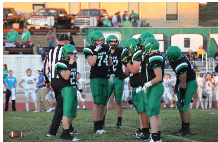
The Governor defense huddle against Aberdeen

couldn't come up with a stop to keep the Riders out of the end zone. Roosevelt ended up winning the game 39-34. After the setback, the Govs looked to get back on track as they hosted Aberdeen for senior night. From start to finish the Govs dominated the game and won 30-0. You can catch the Govs back in action at 6 pm on Thursday at Phil Trautner Stadium.